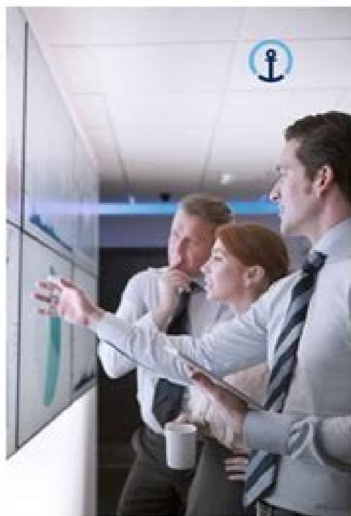
Kuehne+nagel annual report 2020. Kuehne nagel financial calendar. Kuehne nagel annual report 2019.