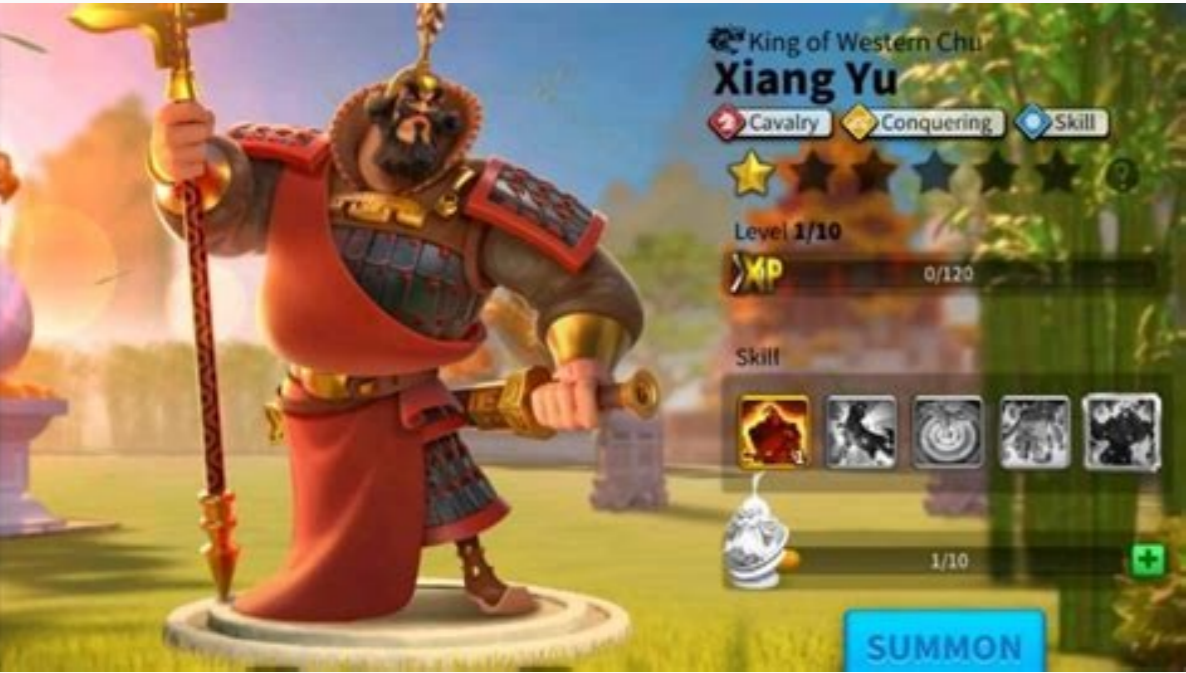
Rise of kingdoms legendary commander talent guide. Best legendary commanders in rise of kingdoms.